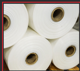
GUSSETED HEAT TUBING