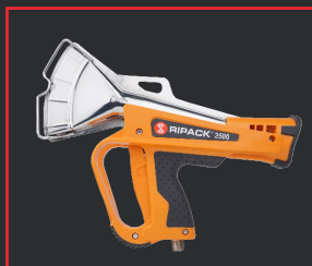
SHRINK RIPACK 2500