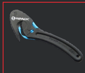
SAFEKNIFE SAFETY CUTTER