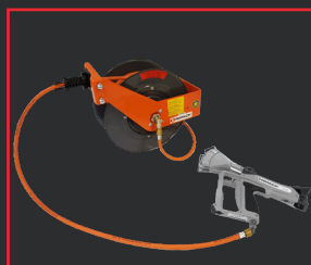
GAS HOSE REEL